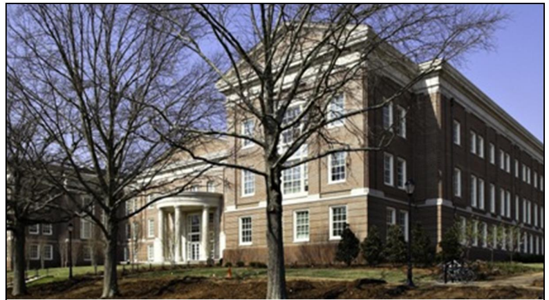
Opened in March 2006, the 140,000 sq. ft. Coverdell Building houses a mix of disciplines including the Bio-Imaging Research Center (BIRC).

(To contribute, contact: Lauren Pryor at lrpryor@uga.edu ).