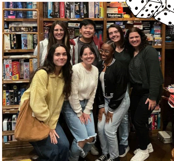
Winning BIG at Rook & Pawn for a game night!