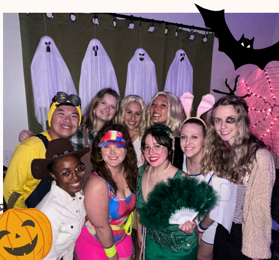
No tricks - only treats this year!!