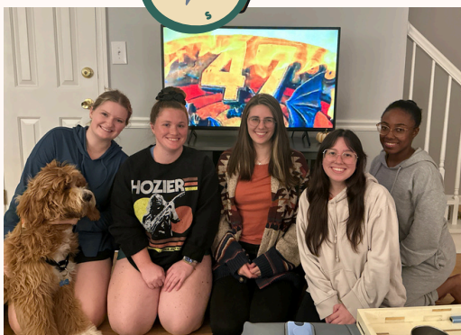
As IF we'd miss an episode of Survivor!